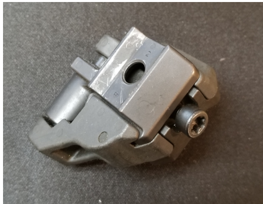
Figure 1: SIG OEM folding stock adapter for MCX/MPX.

Note: At this time, installation of the PMM ULSS requires that you have a SIG OEM folding stock adapter, shown in Figure 1. This is present on most SIG MCX/MPX stock variants.